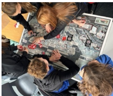
A Year 8 Enterprise Day with the Army. Students were tasked with combating terrorists.

From Years 8 to 10, students enjoy Enterprise Days, apprenticeship talks and mock interviews. In Year 11, students are carefully guided through the post-16 process, where students choose what their next steps might be.