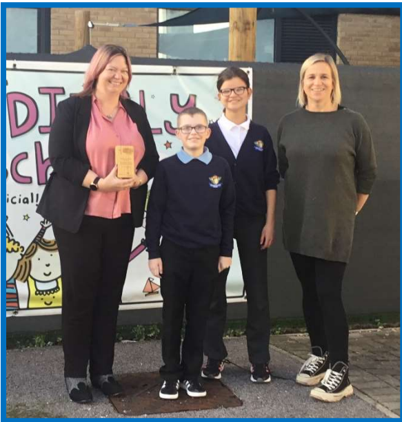
Highfield Littleport with their award

Highfield Littleport were then awarded the prestigious school of the Eastern Region Award and have been invited to London to take part in the Modeshift National Awards event in March 2024. This event showcases the work done in sustainable travel by schools across the whole of England.