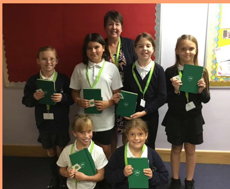
New JTA's at Littleport Community Primary School with their JTA notebooks, pens, badges and lanyards