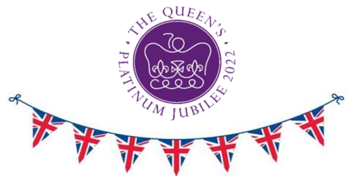
West Wratting Platinum Jubilee Celebrations

Thank you to everyone in West Wratting who had anything to do with making this a fantastic and memorable celebration!