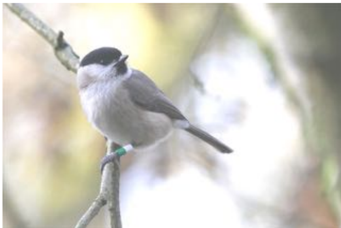
27 th December. Note the lower Green ring. (This hen bird was in Joyce's garden just north of Mill Hill on

As an example of what we're looking for, here is Duncan Mackay's excellent picture of our love triangle protagonist D779564 'White over Green on Left', seen in the old coppice plots of Lower Wood on