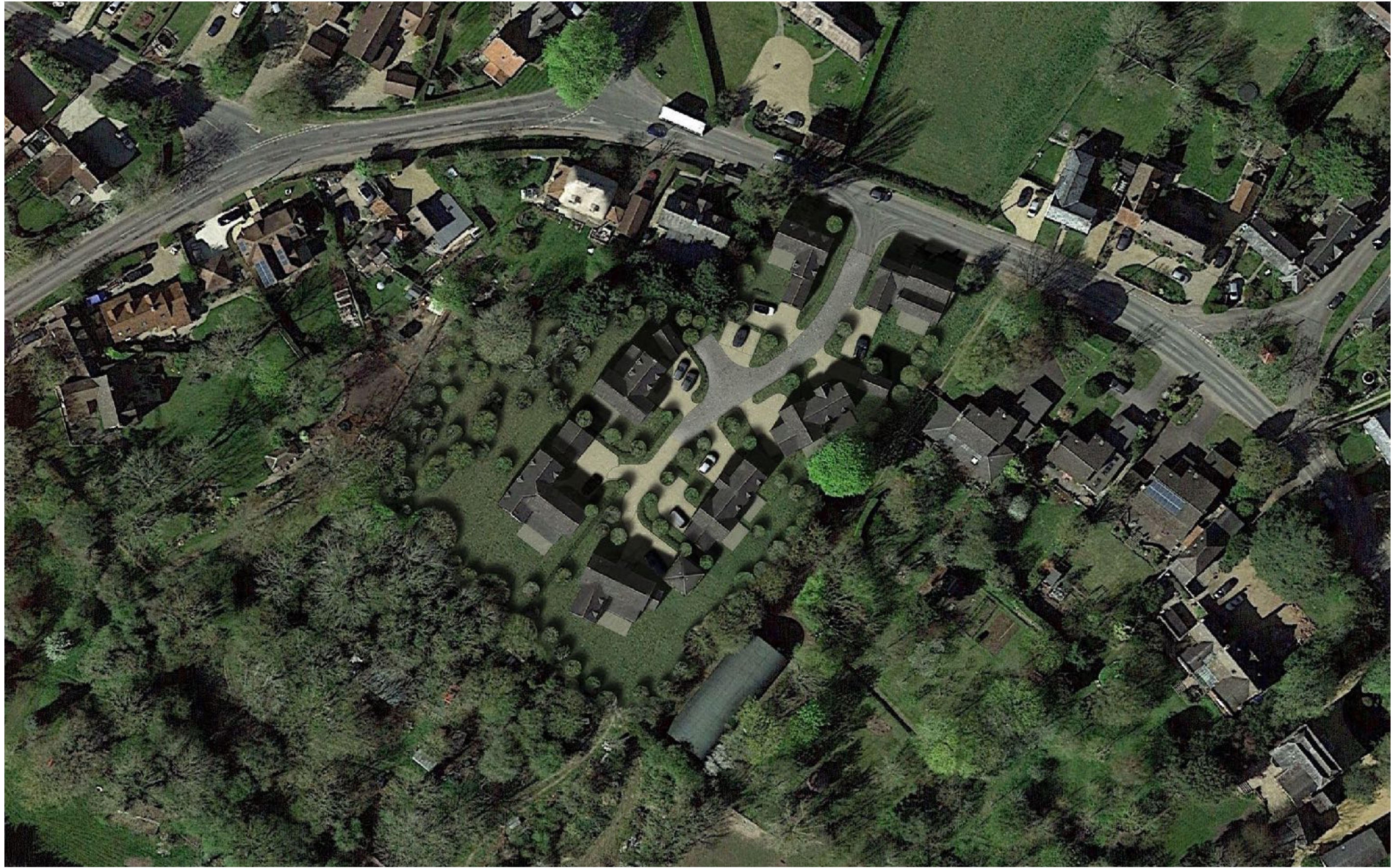
Second-Stage Pre-App Proposal Aerial Montage.