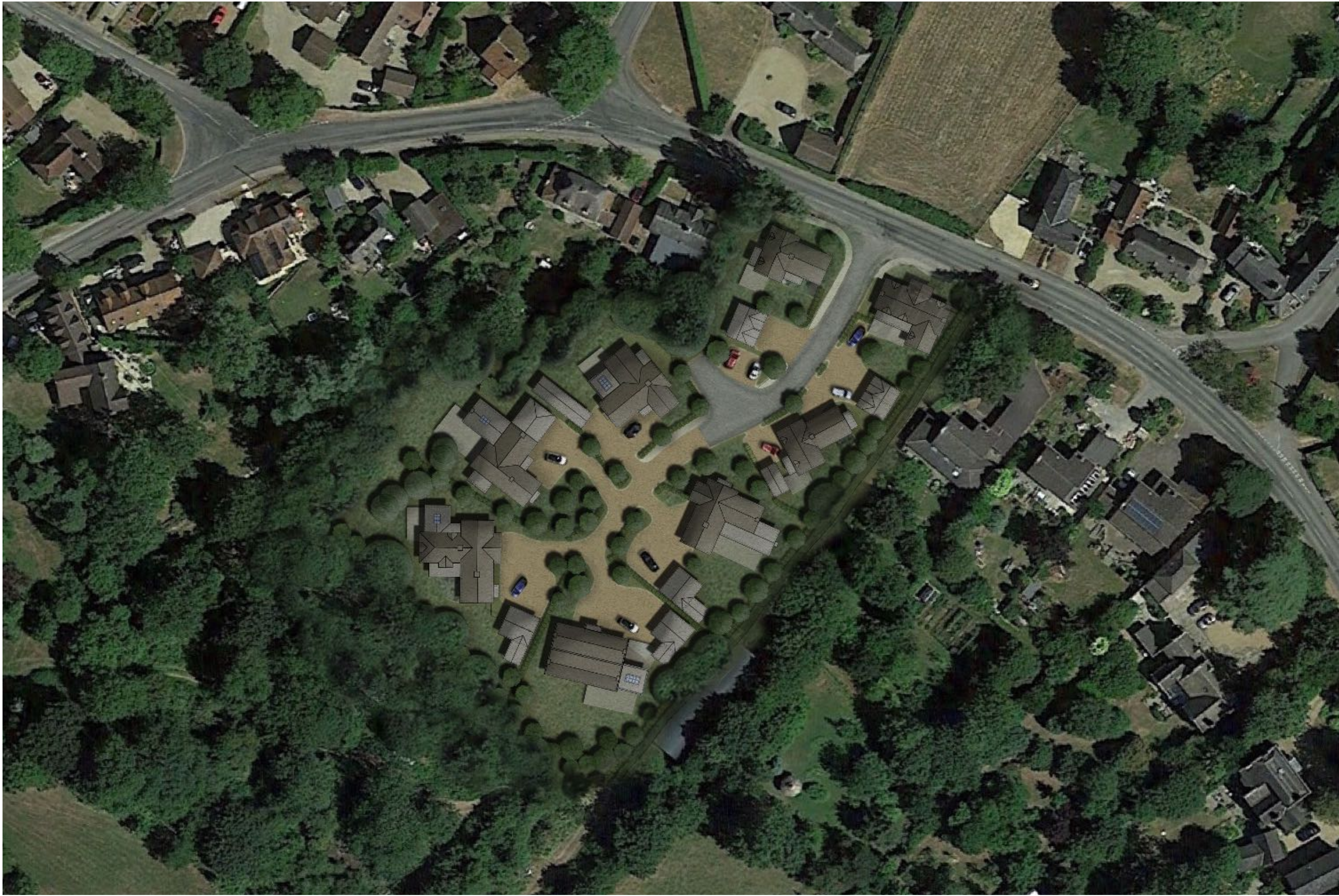
First-Stage Pre-App Proposal Aerial Montage.