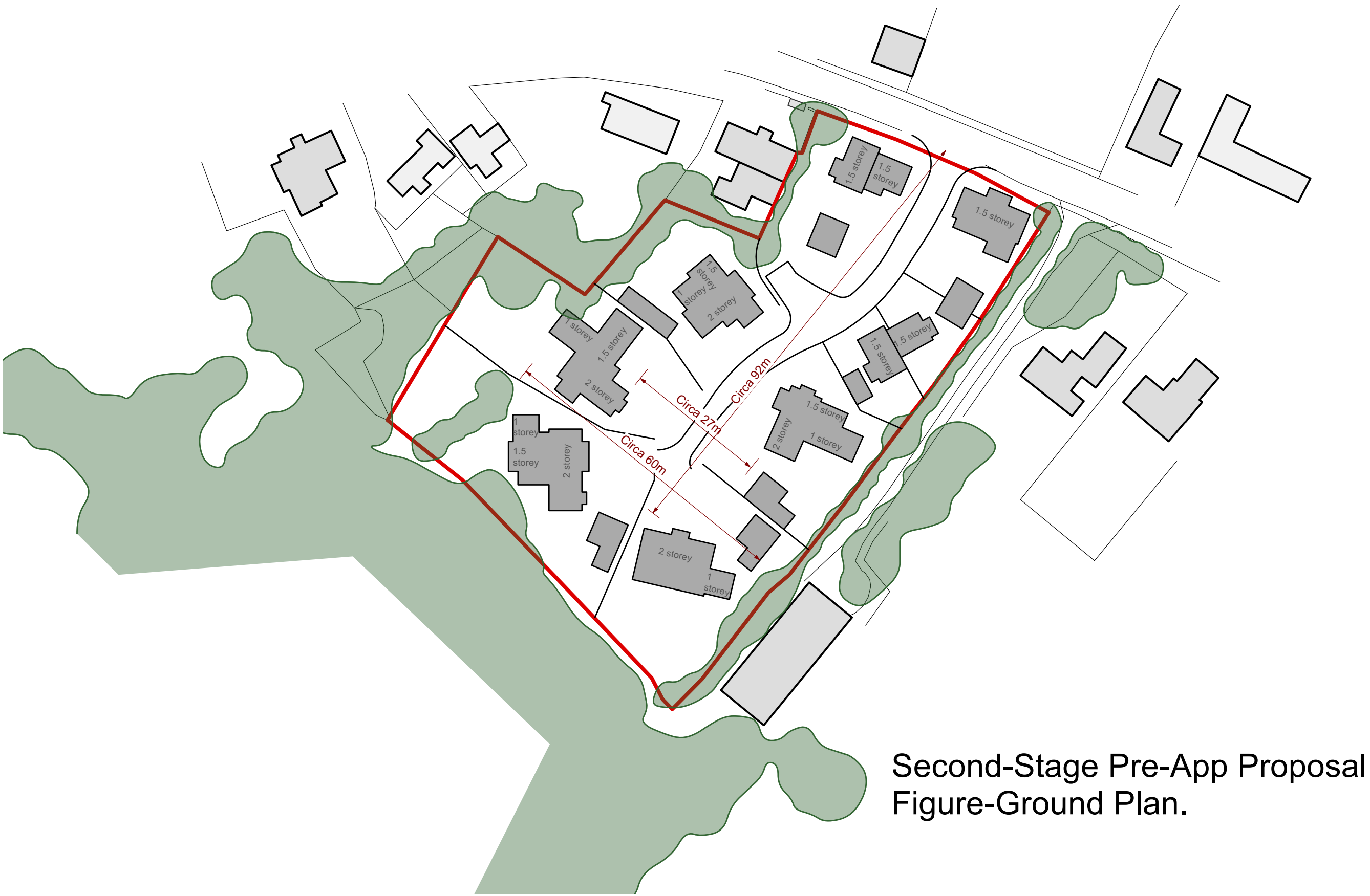
Second-Stage Pre-App Proposal Figure-Ground Plan.