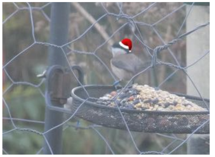
Photo ©Ben Eeles 2016; Santa hat ©Haddon Sundblom/Coca Cola Co., 1931